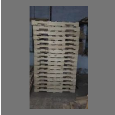
Heavy Duty Wooden Pallets