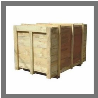
Wooden Export Packaging Export