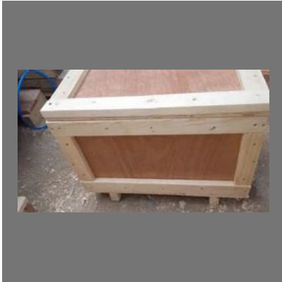
Pine Wood With Plywood Box