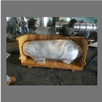
Wooden Packaging Box