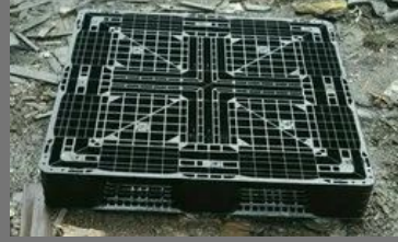
Plastic Pallets For Warehouse