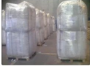
Wooden Packing Pallet