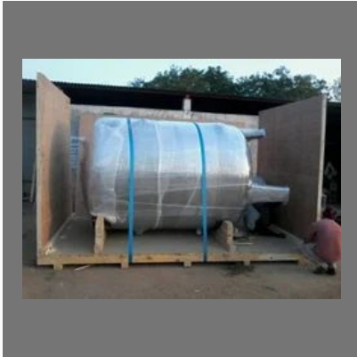
Missionary Packing Box