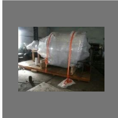
Missionary Packing Pallet