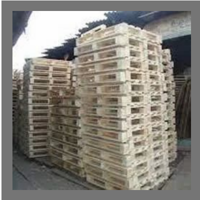
Pine Wood Pallet