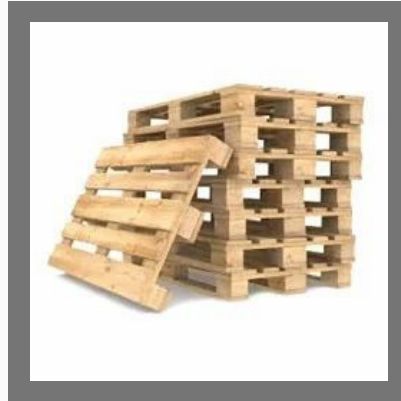
Euro Wooden Pallet